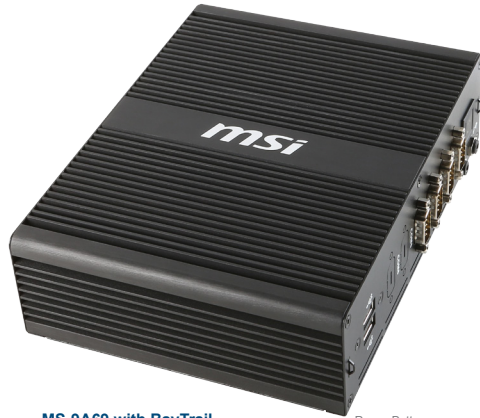
MS-9A69 with BayTrail

Compact-size Ultra Low-power Fanless System with Intel® BDW ULT or Bay Trail-D Series Platform