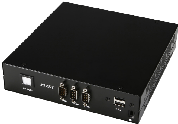
MS-9A78 with Haswell